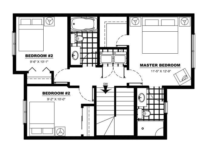
UPPER FLOOR PLAN = 688 SQ FT