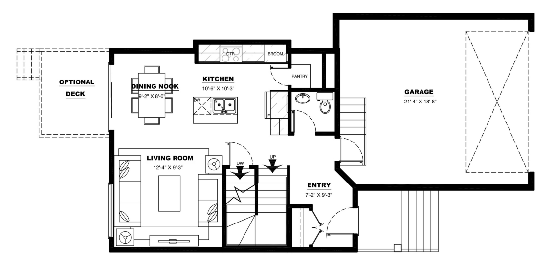
MAIN FLOOR PLAN = 619 SQ FT