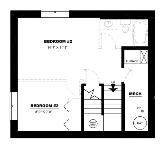
LOWER FLOOR PLAN = 430 SQ FT