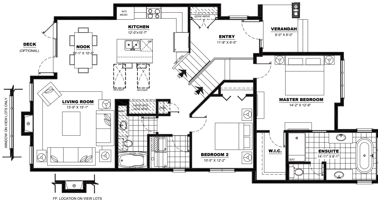
MAIN FLOOR PLAN: 1367 SQ FT